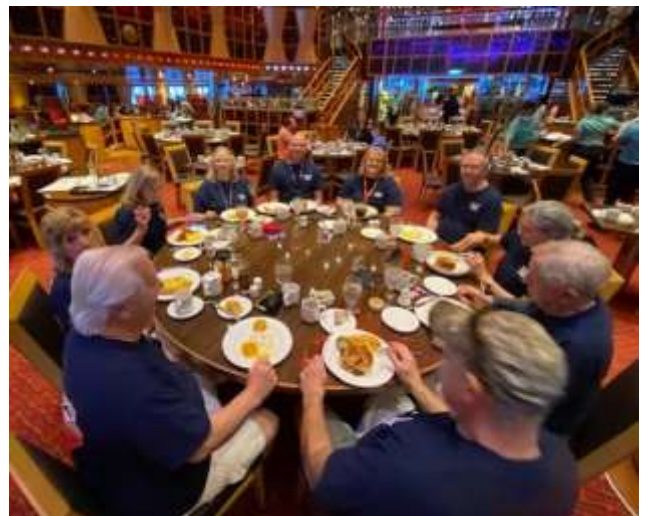
Sunday Brunch on our first sea day.