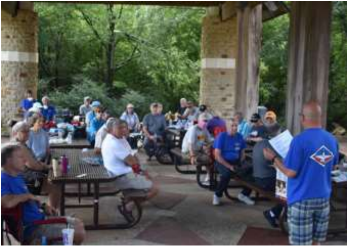
A meeting in the fresh air