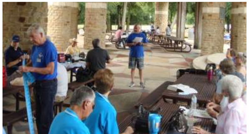
Food, Fellowship, and 50/50 Tickets....who could ask for more?