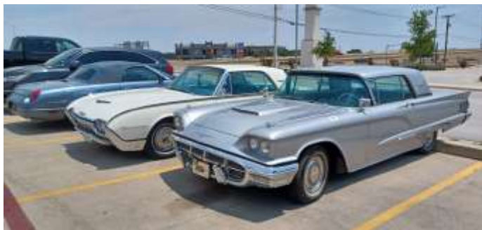
Two Old Birds, and a nice flock of Retros showed up at the Real TX Café in Euless for the July meeting.