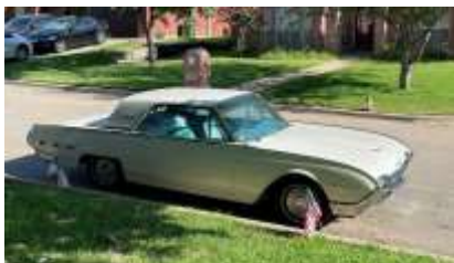
Rob Ivy's '62, parked with pride with the Red White and Blue